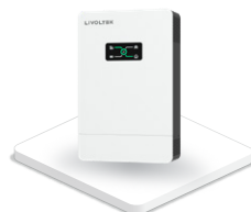
Off-grid Hybrid Inverter