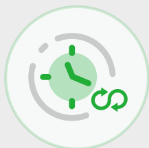
Long Cycle Life