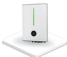
AC Coupled Inverter